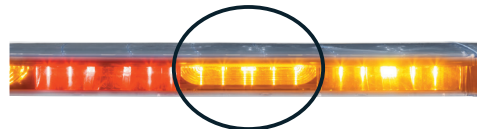
Roll-back Safety Reflector

With the addition of rollback safety reflectors, the Allegiant Max Discrete enhances rear warning during tow truck operations. These reflectors are strategically designed to reduce collision risks by providing enhanced warning to approaching vehicles.