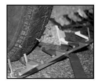
Typically, a tire picks up between four to six spikes and deflates in 12-20 seconds.

Stinger Spike Systems are designed to work on all types of vehicles, including cars, tractor trailer rigs, and city buses. However, the deployment of the system on two-wheel vehicles is not recommended unless the use of deadly force can be legally justified.