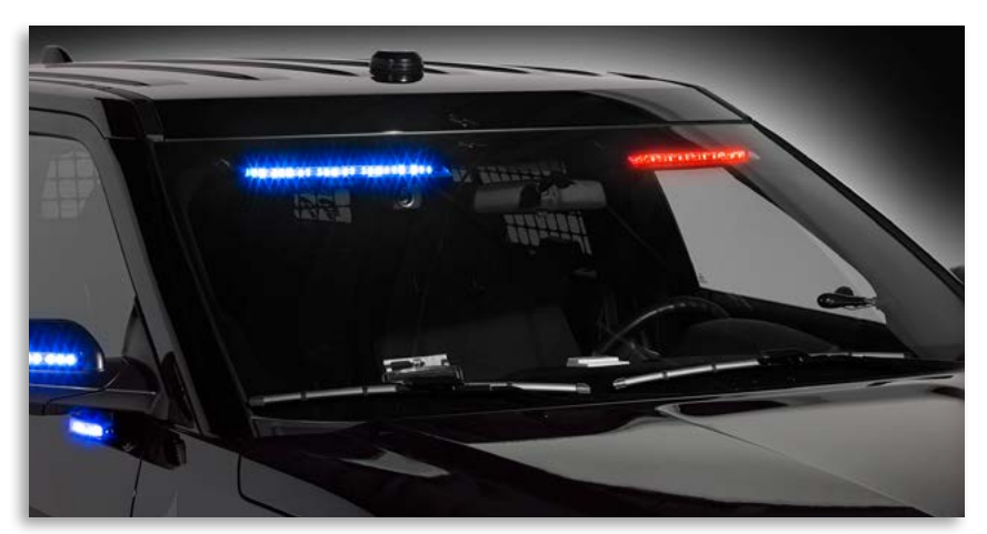
SpectraLux ILS on a Ford Interceptor Utility