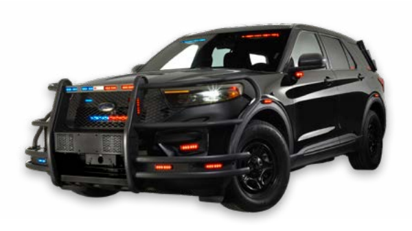
2020 Ford Police Interceptor Utility with Center-Focused ILS