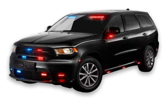
2019 Dodge Durango with Center-Focused ILS