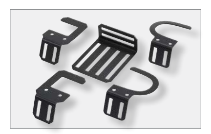
Bracket kit included with universal models

OBD integrated Rear Hatch/Rear Deck/Rear Window configurations are specifically intended to work with the Pathfinder® siren and OBDCABLE sold separately.