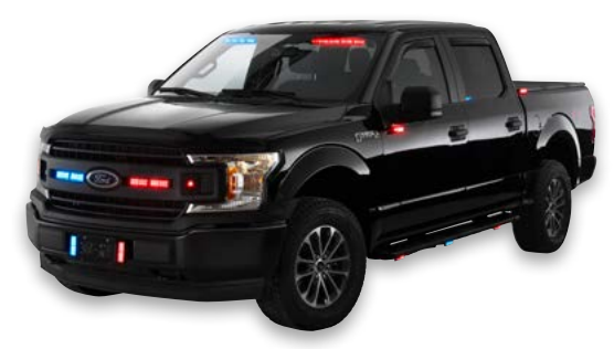
2019 Ford F-150 with Center-Focused ILS