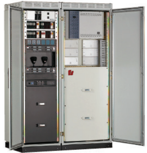
Rack Mounted ECHO System