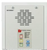
A flush mount kit is included for recessed applications as shown.