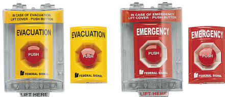
External push button activation