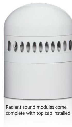
Radiant sound modules come complete with top cap installed.