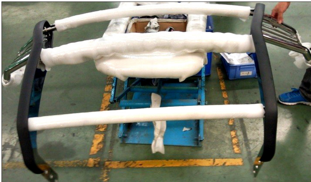
Figure 5 Installation complete