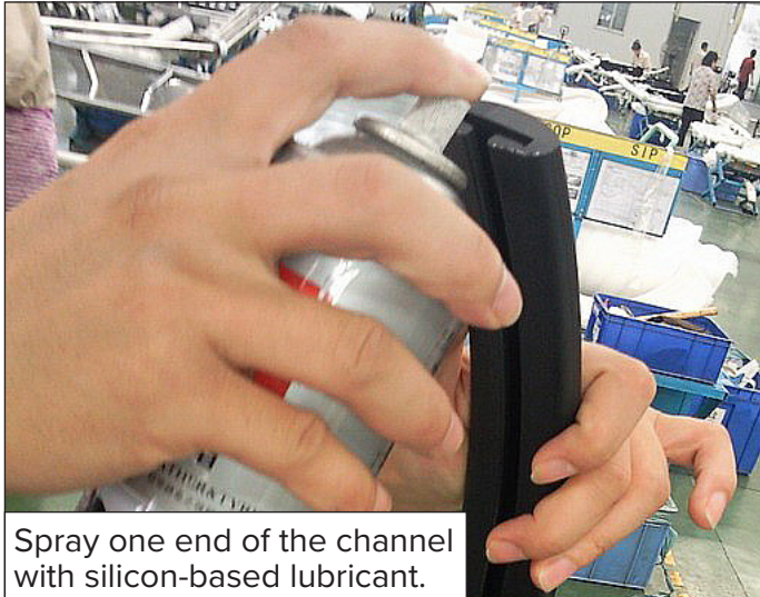
Figure 3 Apply lubricant to ease installation