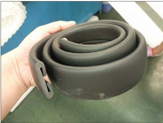
Figure 1 Rubber molding