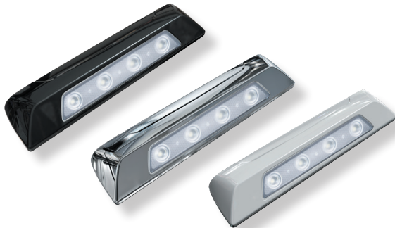
COM7 Scene Light models are available with Black, Chrome, or White polycarbonate bezels