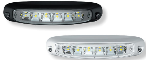
COM9 Scene Lights available with Black or White die-cast aluminum housing