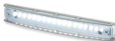
COMSTLS18C-W mounted on a COMSTL-BKT