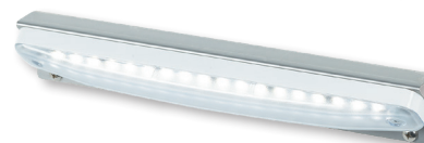
COMSTLS18C-W mounted on a vertical surface with a COMSTL-BKT45