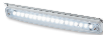
COMSTLS18C-W mounted on a horizontal surface with a COMSTL-BKT45

Commander is a trademark of Federal Signal Corporation.