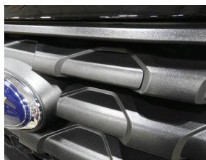
2016–2019 Police Interceptor Ford Utility grille shown without the light

Suitable for external mounting applications, each model includes a Black surface mount bezel and a stud mount. Shown below is the MicroPulse C Series installed in the pre-drilled grille of the Ford Police Interceptor Utility, 2016-2019 and 2020-2022.