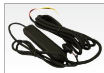
Flasher / Cable