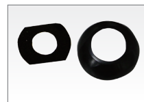
Bezel / Gasket