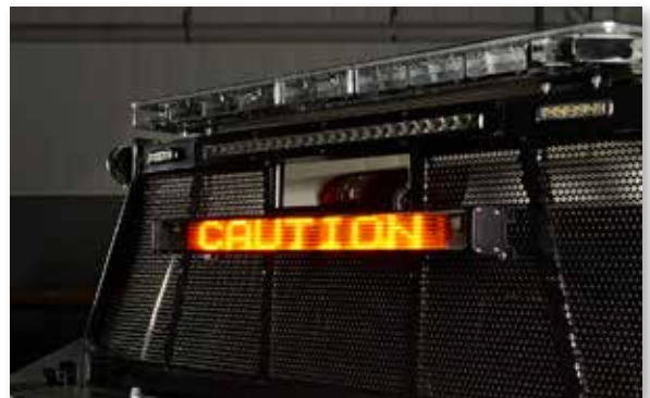
MB1 mounted on a HRX Series Headache Rack installed on a Chevrolet Silverado