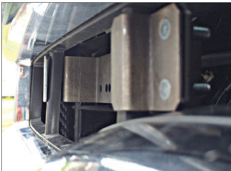
Figure 1 Brackets positioned on vertical bars on grille