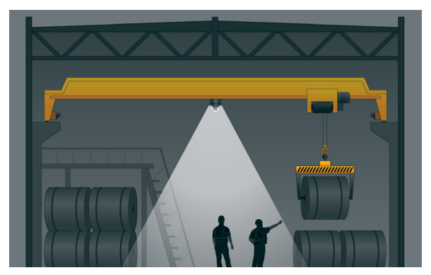
371LEDX with the 371LED-KIT-CR reflector installed reflects the light beam at 22.5 degrees from the vertical orientation resulting in a focused light output.