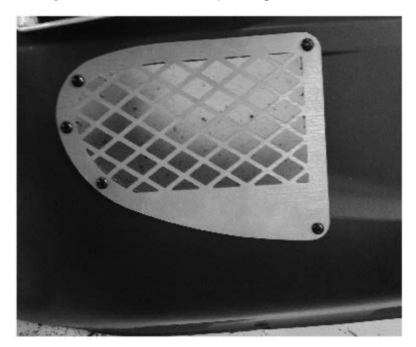
Figure 3 Grille mounted on passenger-side front facia