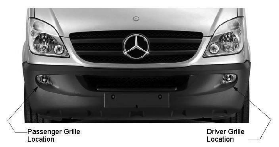
Figure 1 Grille locations on the Mercedes-Benz Sprinter

1. See Figure 1. Select the mounting location.