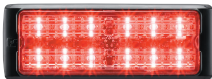
MPS123U full flash