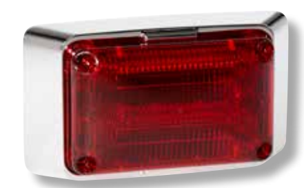
Traditional 4x3 QuadraFlare shown with optional Chrome bezel