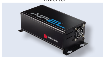
Infrared/Thermal Power Supply