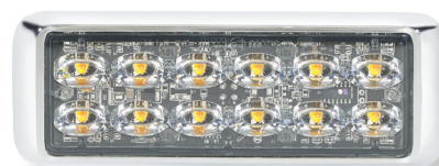
Optional bezels available in Chrome or White