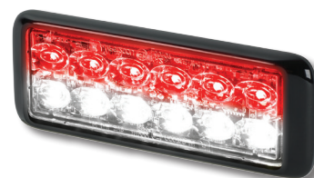
MicroPulse Ultra 12-LED models are available in split-colors