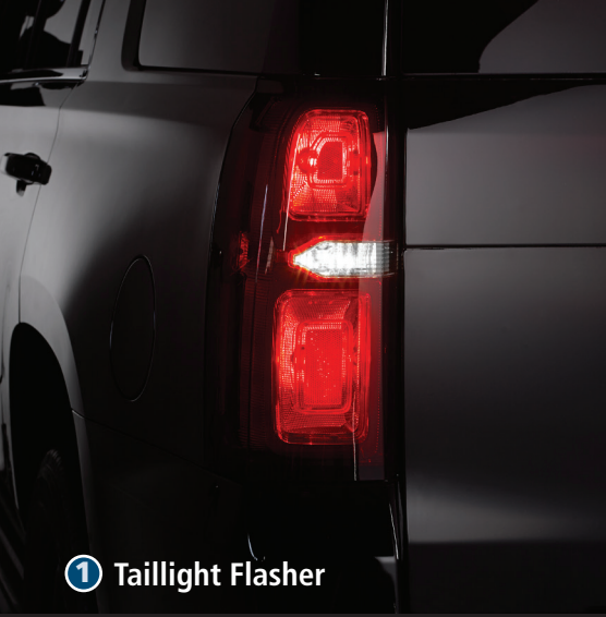
① Taillight Flasher