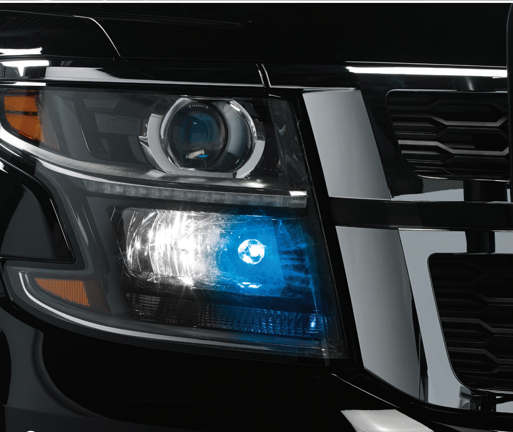
⑤ In-Line Corner LED