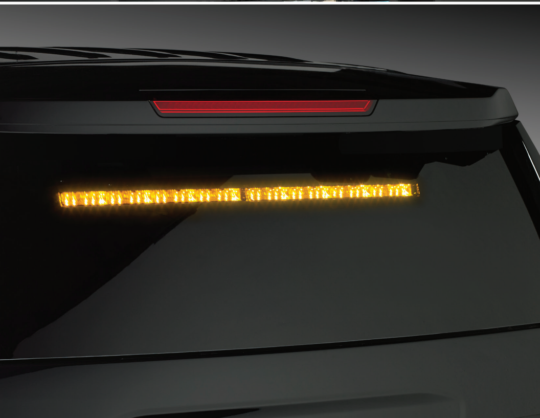
③ CN SignalMaster (8-head/internal)