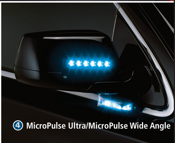
④ MicroPulse Ultra/MicroPulse Wide Angle