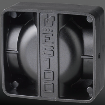
DynaMax / ES100