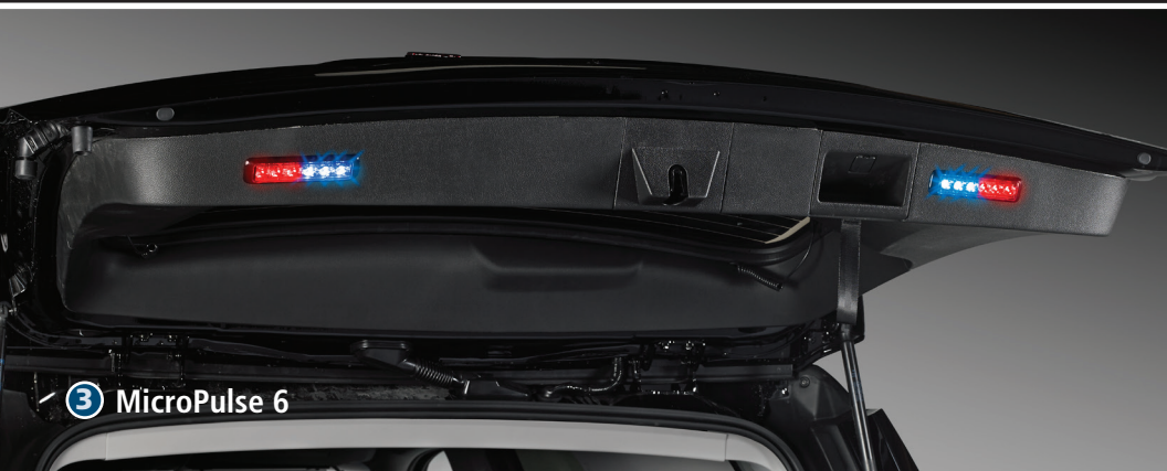
③ MicroPulse 6

Two-head In-Line Corner LED System with 19 selectable flash patterns