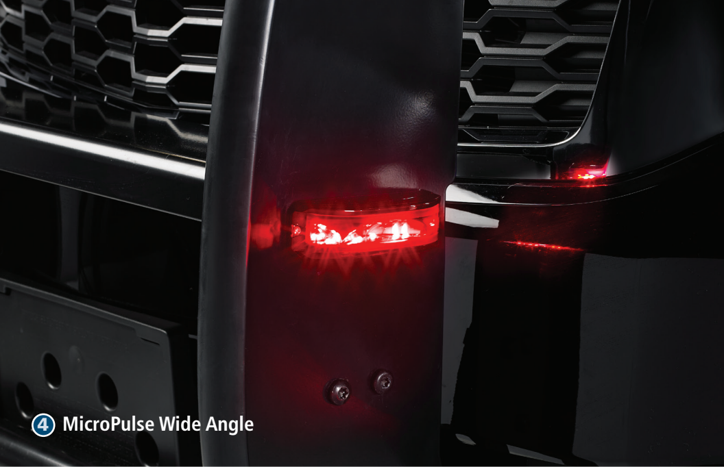
④ MicroPulse Wide Angle