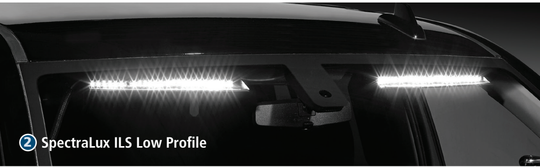
② SpectraLux ILS Low Profile