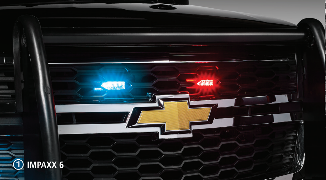
① IMPAXX 6