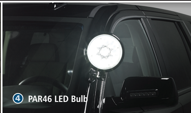
④ PAR46 LED Bulb