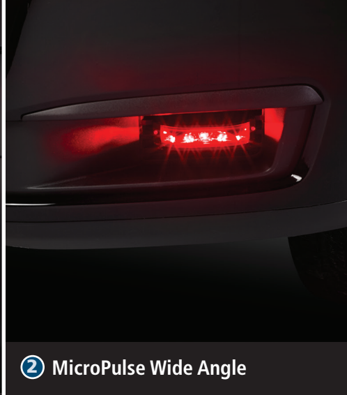
② MicroPulse Wide Angle