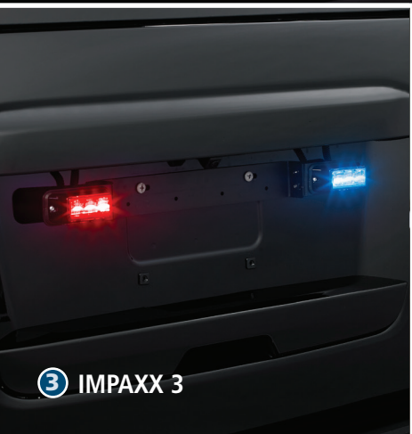
③ IMPAXX 3