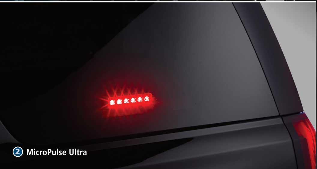
② MicroPulse Ultra