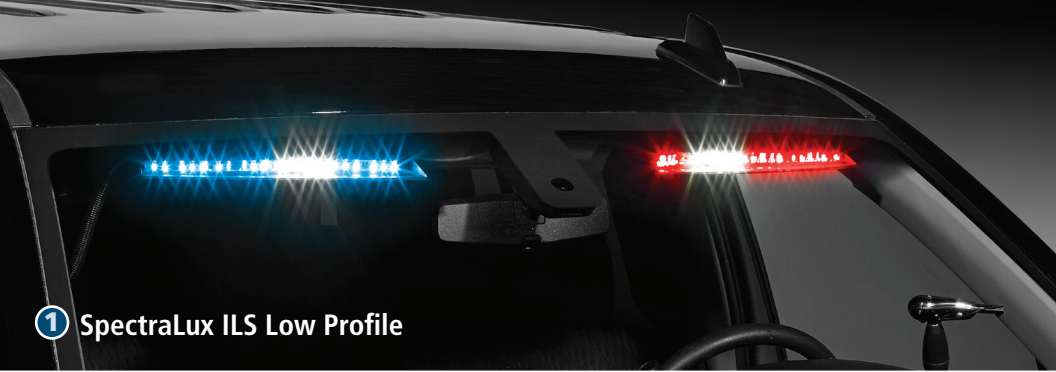
① SpectraLux ILS Low Profile