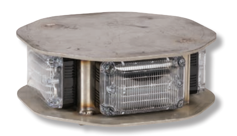
(Shown with lights, sold separately)

605300D Kit, weather tight connector, three pin