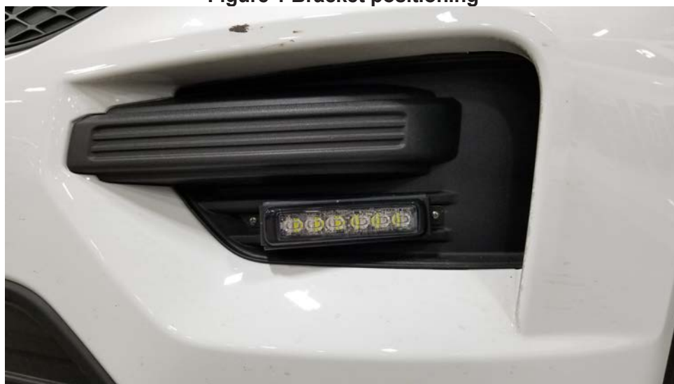
Figure 1 Bracket positioning