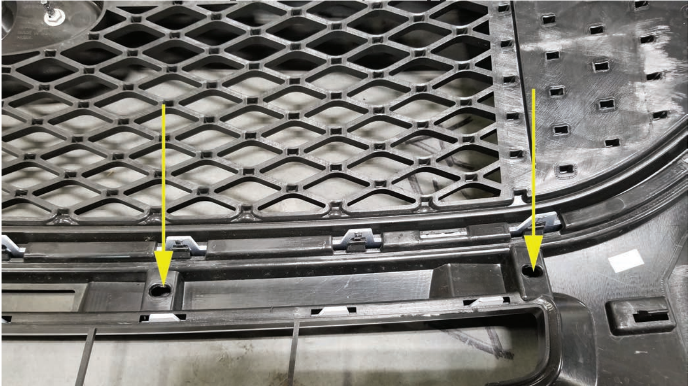
Figure 1 Ford Interceptor Utility grille