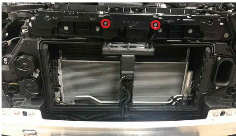
Figure 1 Ford Interceptor Utility grille