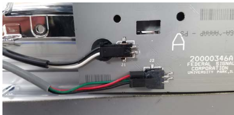
Figure 2 Circuit board