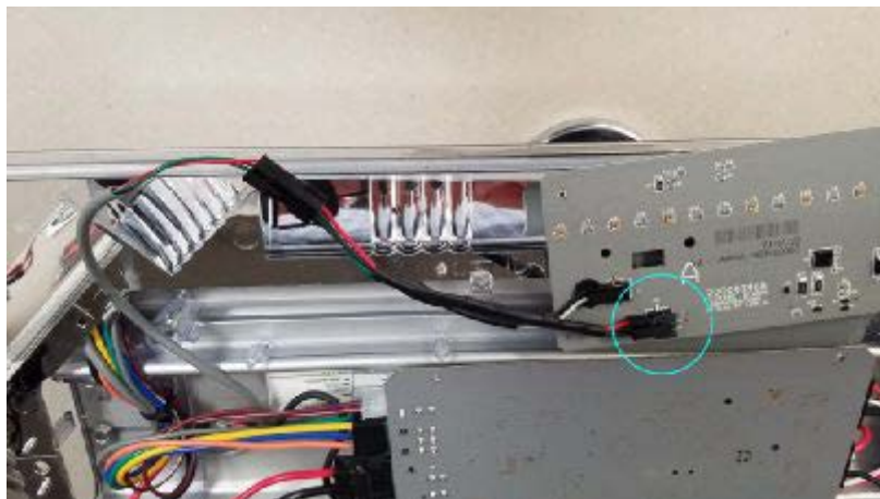
Figure 5 Attaching the cable to the circuit board