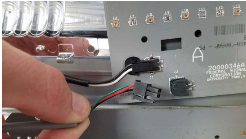
Figure 3 J2