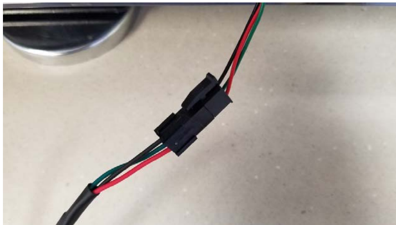
Figure 4 Attaching the cables