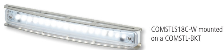
COMSTLS18C-W mounted on a COMSTL-BKT