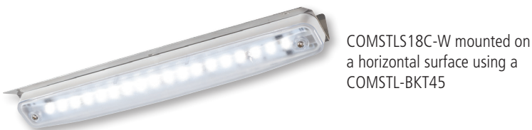
COMSTLS18C-W mounted on a horizontal surface using a COMSTL-BKT45