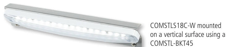
COMSTLS18C-W mounted on a vertical surface using a COMSTL-BKT45