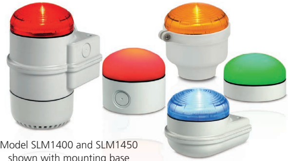
Model SLM1400 and SLM1450 shown with mounting base options (ordered separately)