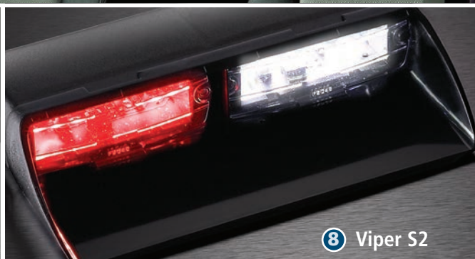
⑧ Viper S2