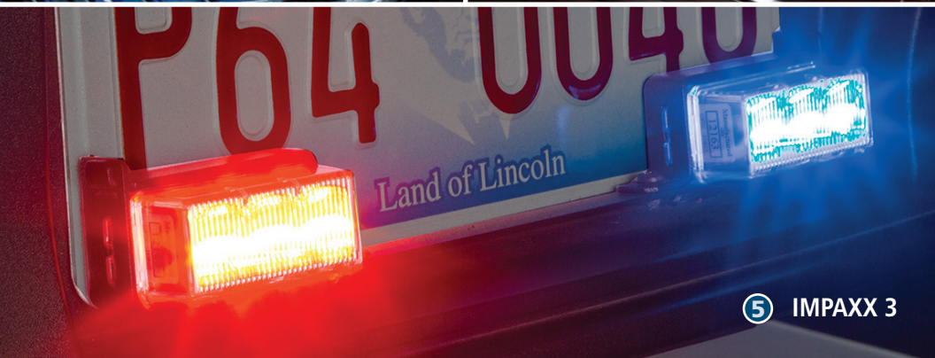
⑤ IMPAXX 3