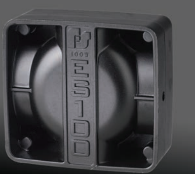
DynaMax / ES100