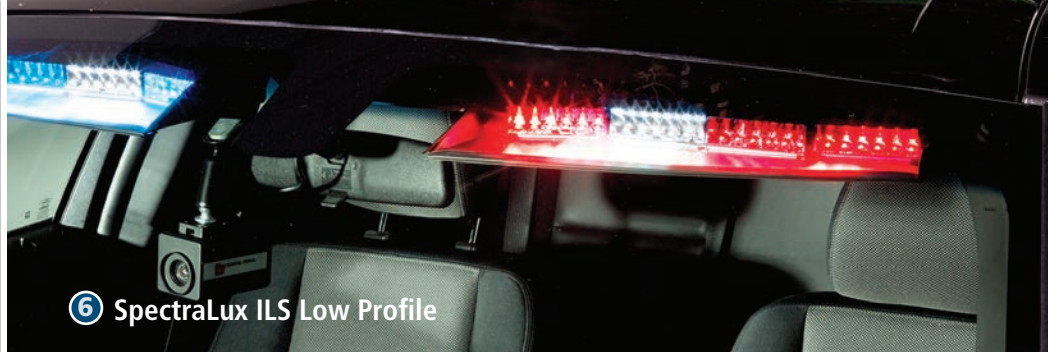
⑥ SpectraLux ILS Low Profile