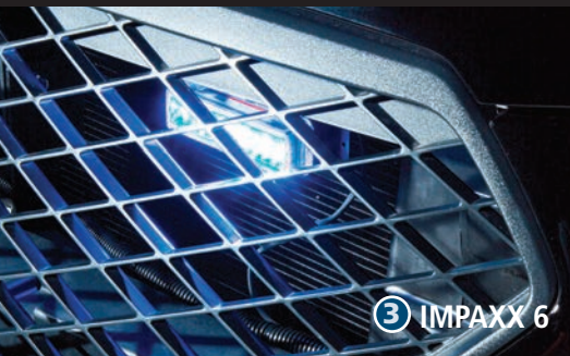
③ IMPAXX 6

Three LED models can operate independent or synchronized with other lighthead