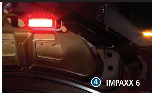
④ IMPAXX 6