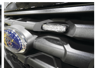
MicroPulse C Series shown mounted in grille