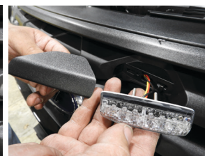
MicroPulse C Series shown with optional stud mount for easy installation