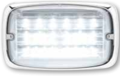
9x7 Scene Light