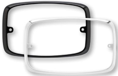
Optional Chrome or Black bezel

Brake/tail/turn, back-up and arrow models are available in 6x4 models. Horizontal 4-up and 3-up castings are available and require no special die-cut to the body of the vehicle.