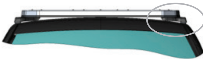
Image of Integrity lightbar on Dodge Charger with new “Low Hook” mount