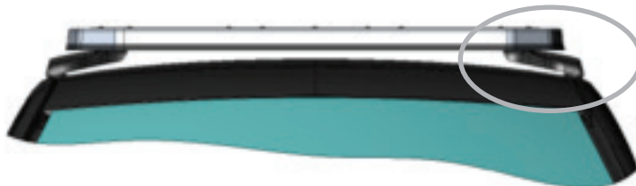
Image of Integrity lightbar on Dodge Charger with standard “Hook” mount