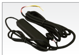
Flasher / Cable