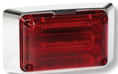
Traditional 4x3 QuadraFlare shown with optional Chrome bezel