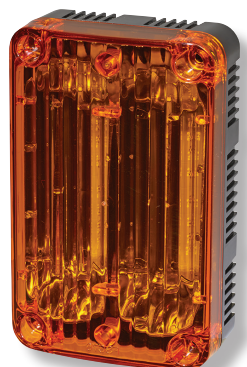
DOT 4x3 QuadraFlare

Federal Signal announces the release of two new additions to our QuadraFlare family of LED warning lights. The new 4x3 QuadraFlare traditional perimeter light and DOT models are designed with a unique reflector technology for superior off-axis warning and are backed by a five-year LED warranty.