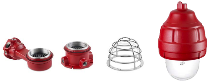
(Shown with pendant mount)