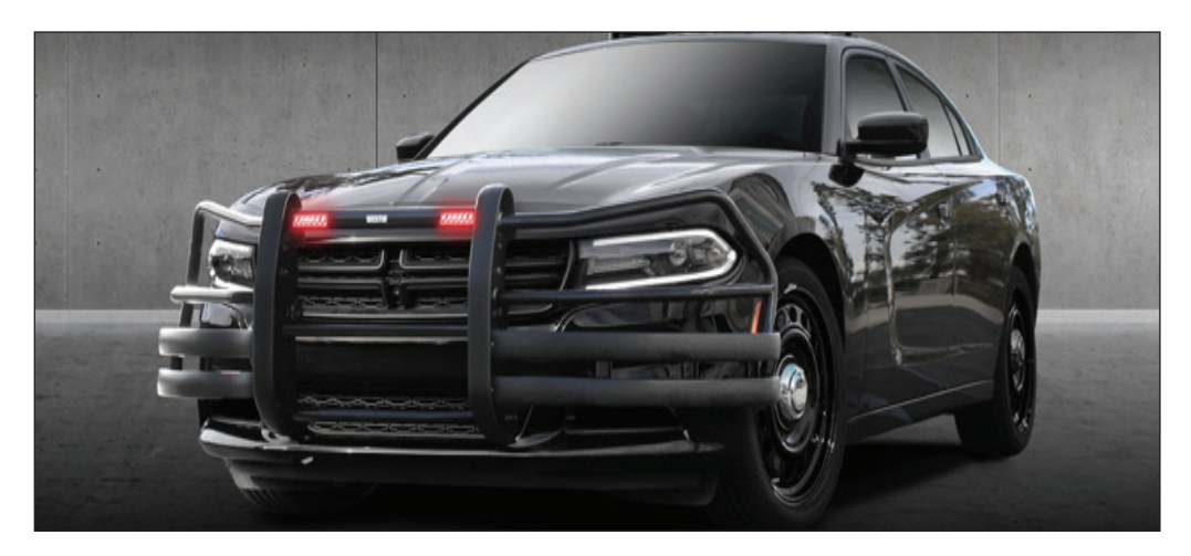
Push Bumper, Top Channel, Pit Bar and Wing Wrap shown installed on a Dodge Charger

For more information, please contact your local Federal Signal Sales Representative, visit our website at www.fedsig.com or contact us at 800-264-3578