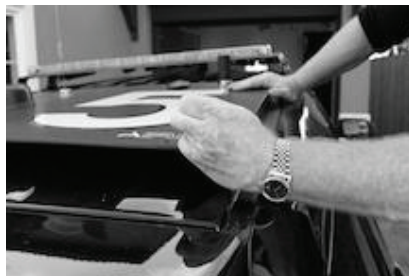
Figure 5 Position AirDek on vehicle