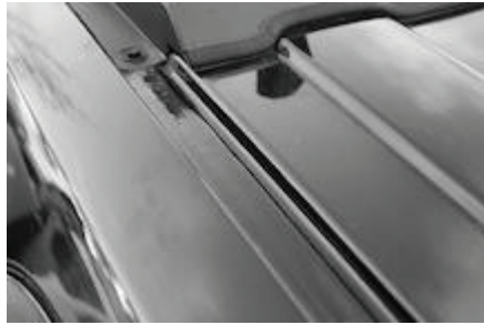
Figure 3 Remove vehicle channel molding