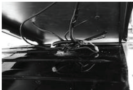
Figure 4 Run wiring through compression fitting