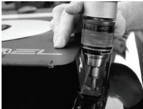
Figure 10 Secure AirDek to vehicle