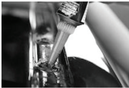
Figure 8 Apply RTV or silicone