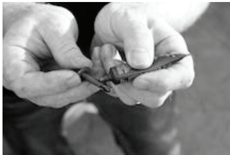
Figure 9 Apply blue thread