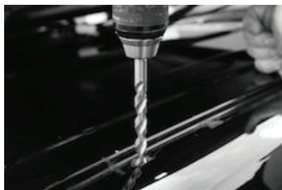
Figure 6 Drill mounting holes