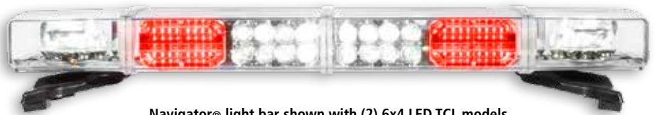
Navigator® light bar shown with (2) 6x4 LED TCL models