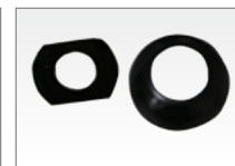
Bezel / Gasket