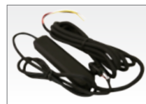
Flasher / Cable