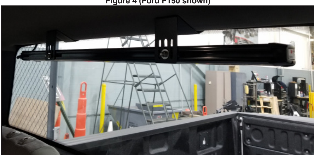
Figure 4 (Ford F150 shown)

5. If installing a CN SignalMaster™, install the light head to the brackets using the 8 #10 screws supplied with this kid. If installing a Latitude, install the light head to the brackets using the carriage bolts, nuts, and washers supplied with the latitude. See Figure 4.