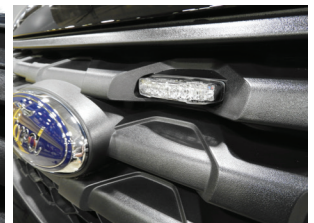
MicroPulse C Series shown mounted in grille