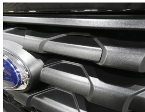
2016-2019 Police Interceptor Ford Utility grille shown without the light

Suitable for external mounting applications, each model includes a Black surface mount bezel and a stud mount. Shown below is the MicroPulse C Series installed in the pre-drilled grille of the Ford Police Interceptor Utility, 2016-2019 and 2020-2021.