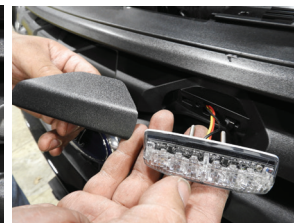
MicroPulse C Series shown with optional stud mount for easy installation