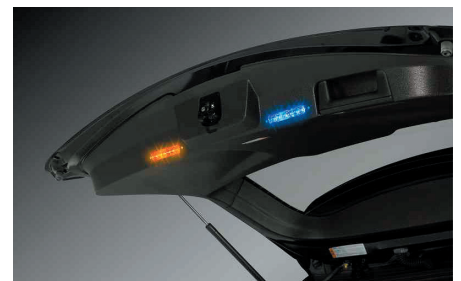
(1) MPS600-AA and (1) MPS600-BB on back hatch