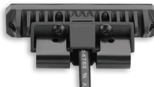
MPS6 shown with grille/hood mount