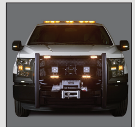
2015-2020 Ford F-150