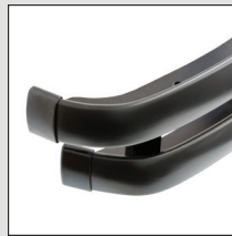
Plastic End Caps for a Finished Look