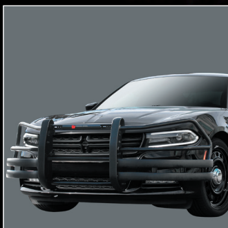
2015-2022 Dodge Charger