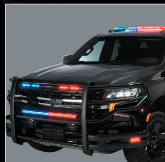
2021-2022 Chevrolet Tahoe