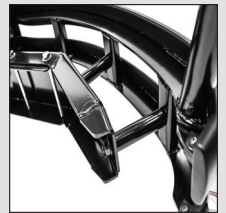
Heavy Duty Brackets