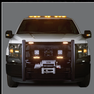
2015-2020 Ford F-150