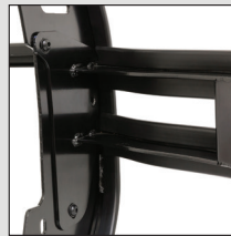
Bolts Directly on to Push Bumper