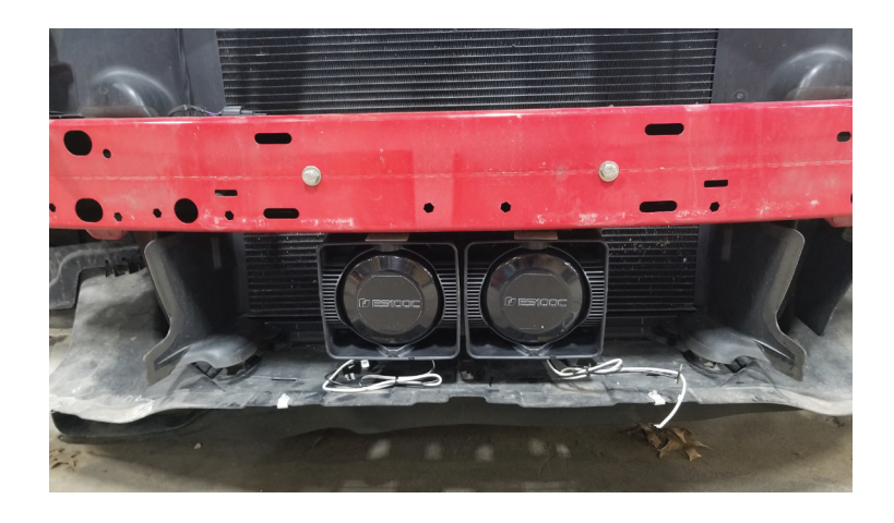
ESB2-CHGR15 Bracket Kit for the 2015 Dodge Charger

Figure 1 ESB2-CHGR15 bracket kit installed on Dodge Charger