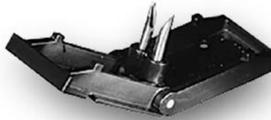
90502 Rat Trap II