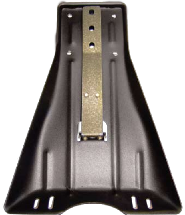
A metal strap has been added to deter mount from bending