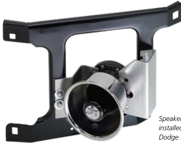
Speaker bracket shown installed on existing Dodge bumper frame.