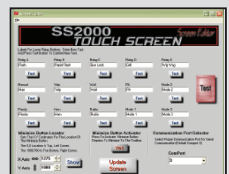
The Screen Editor allows the installer to select text, comport, and the location of the minimized program.