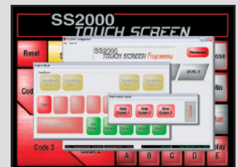
Multiple screens allows the installer to program each level of operation.