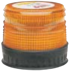
401 strobe (220300)