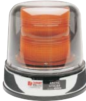
Arctic Strobe (211777)