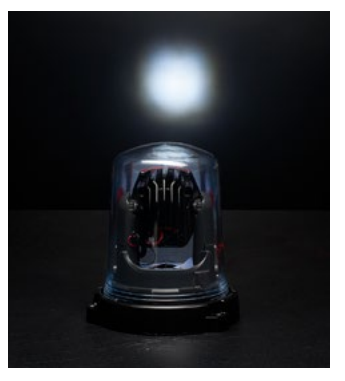
Spot Light 4-degrees for 'pin-point' lighting

NightSpire includes a full-featured wireless controller with an easy-to-grip design and back-lit pad-printed tactile buttons for identification when activated. Each wireless controller can pair up to three lights, if needed, eliminating multiple controllers. NightSpire has two memory control functions that enable users to move the spotlight to programmed locations.