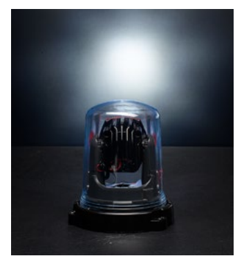
Flood Light 50-degrees to illuminate a scene