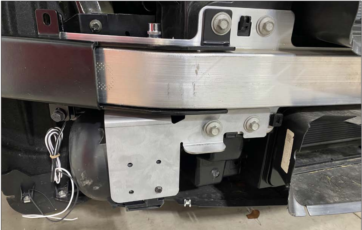
Figure 3 Bracket (Passenger side shown)

NOTE: When mounting the driver side bracket, relocate the rubber harness mount found behind the driver side bumper.